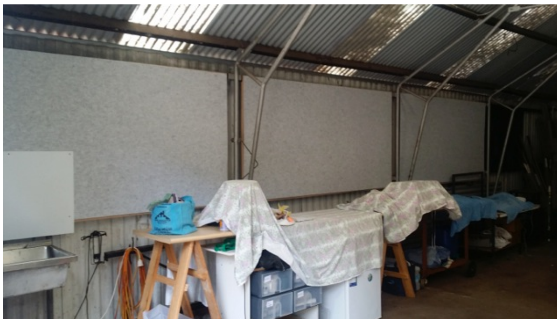
The shed after (left)