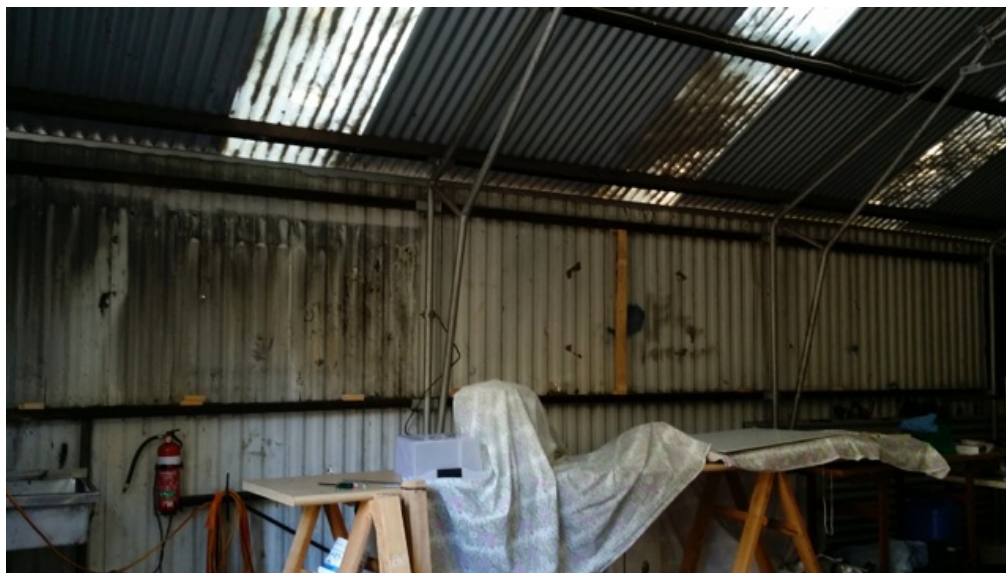
The shed before (above)