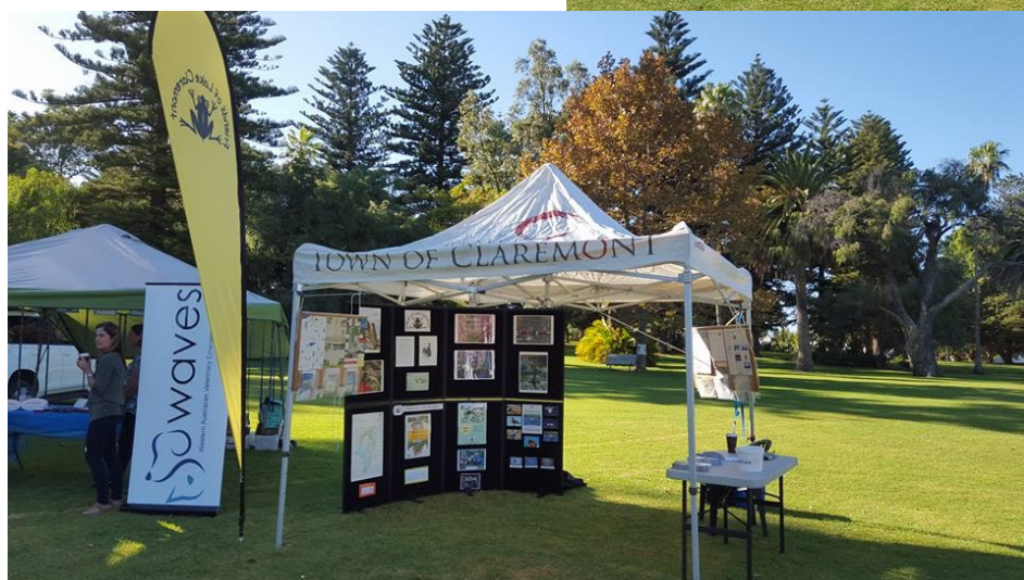
The FOLC display at 'Pets in the Park'