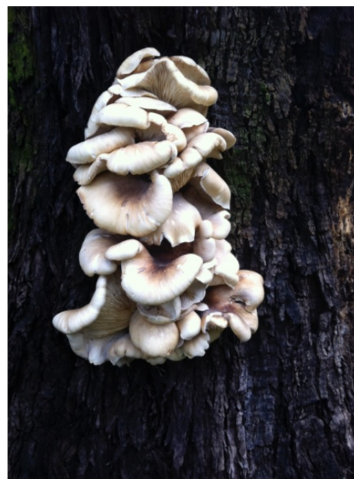
Punk fungus on a Tuart tree

This event is hosted by the Friends of Lake Claremont at the Claremont Aquatic Centre, Davies Road, Claremont. The talk commences at 6:30 pm. Doors open for refreshments at 6:00 pm. A gold coin donation is appreciated.