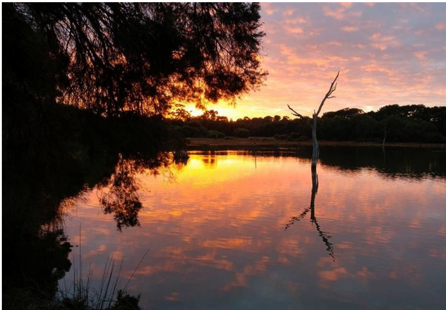
Sunrise at Lake Claremont