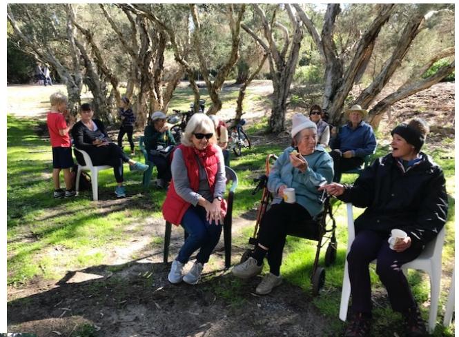
Volunteers enjoy their morning tea