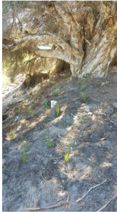
Planting along the wetland bank under a paperbark tree

The Friends of Lake Claremont have kicked off the planting season with the help of year 10 students from Scotch College and Christ Church Grammar School on May 26th. The boys planted 360 native seedlings on the bank of the wetland during their regular Friday afternoon volunteer session which lasts one and half hours. The focus of the planting season this year will be the restoration of the eastern edge of the lake edge, or wetland buffer as it is known. The plants chosen will be low in height to maintain a view of the lake. The plantings will help protect nesting sites of birds and provide food and shelter for many other creatures