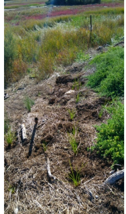
More planting by the Year 10 boys