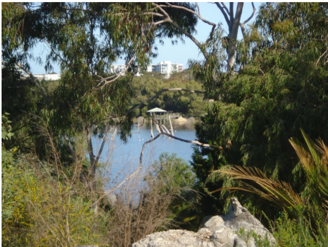
Looking South across Lake Claremont

Soozie Ross with help of a group of Scotch College Year 10 boys has done a wonderful job of cleaning up the 'old shed' and turning it into a useable space. Read all about it on page 2.