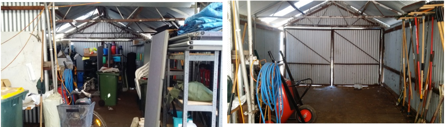
Before and after photos of the dog leg section

The park vehicle (which we have use of under agreement with Town of Claremont) is going to be parked in the small dogleg part of the shed, with the shed doors on that side reincarnated to allow the vehicle to be driven in and out of the side door, freeing up the main part of the shed for us.