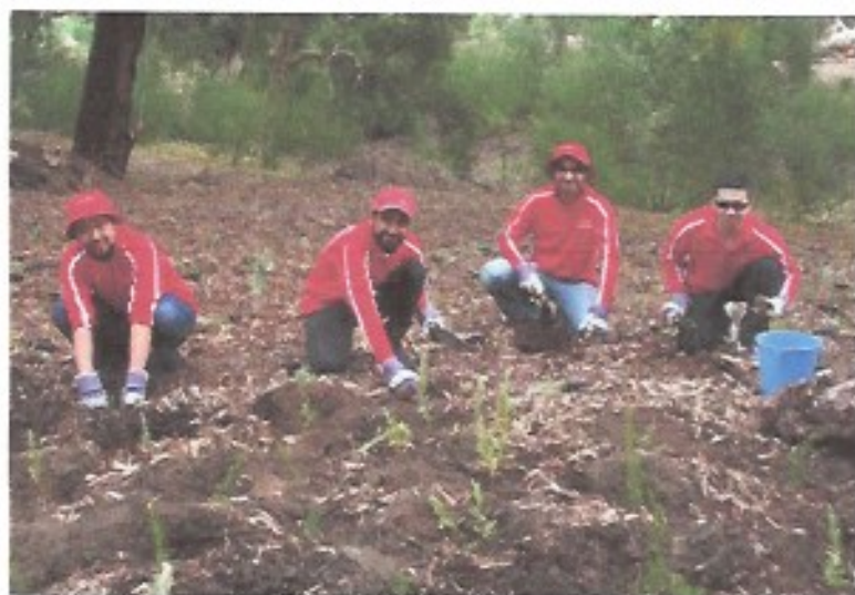
Top: Woodside employees creating woodland – State NRM Project. Thank you to Volunteering WA for organizing the event.