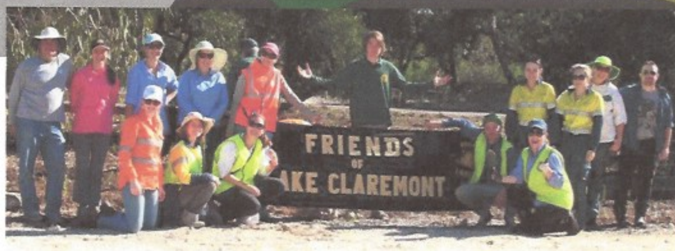
GHD and Main Roads' employees along with the Shah Satnum Ji Green S Welfare Force Wing joined the community event "Planting for the Birds".