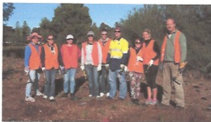
Telstra employees restoring the wetland buffer on the Community Environment Grant- Caring for Our Country Program

More photos and acknowledgements on the following page!