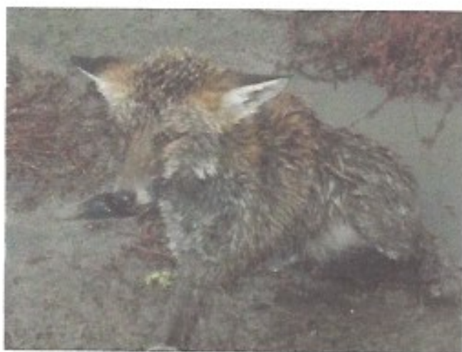
Caught! A Female Fox at Lake Claremont

It is vital to keep foxes out of the Lake Claremont area especially during swan and duck breeding season. Foxes can wreak havoc stealing eggs and killing cygnets and ducklings. If you see a fox please report it to the Town of Claremont 9285-4300.