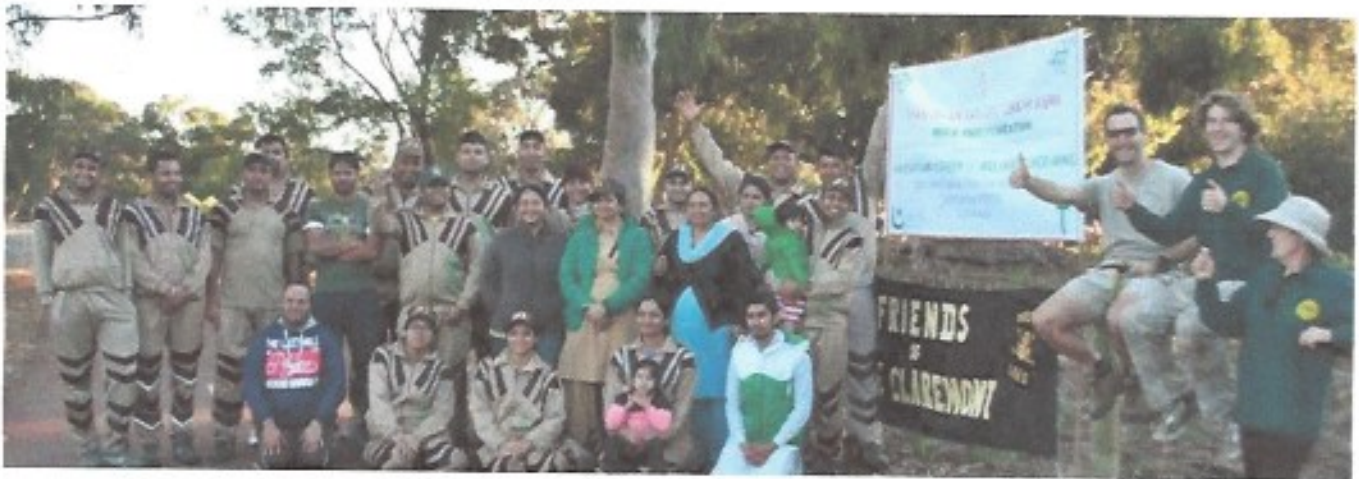
The "Force" with a few FOLC members celebrating their hard work after planting 5000 seedlings in one day.

The stars this season were the Shah Satnam Ji Green S Welfare Force Wing. Dedicated humanitarian volunteers, we are grateful for their contribution to our community. In the four sessions they have attended, they have planted over 15,000 seedlings.