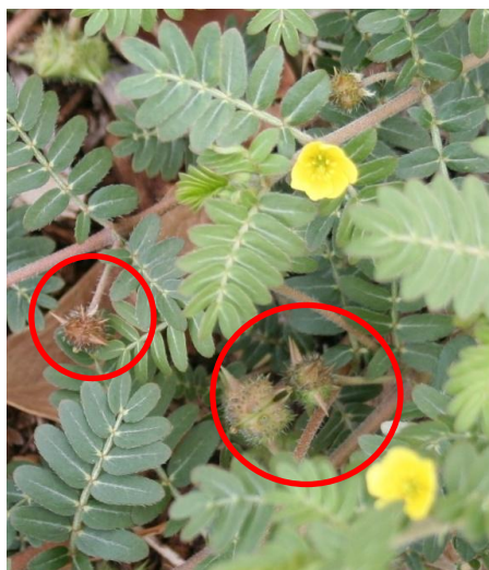
Thorns on the Caltrop