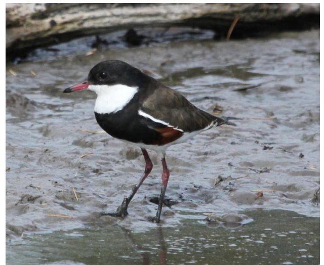
Red-kneed Dotterel - a new arrival