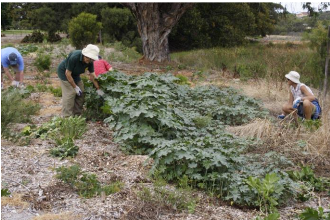
Castor Oil Plant Patch Before ...

FOLC Busy Bees are held on the second Sunday morning of every month in summer time, from 8am-10am.