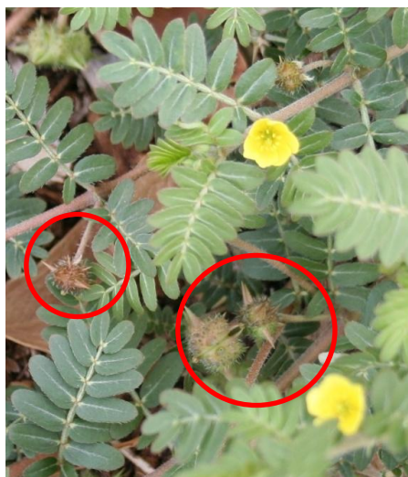
Thorns on the Caltrop