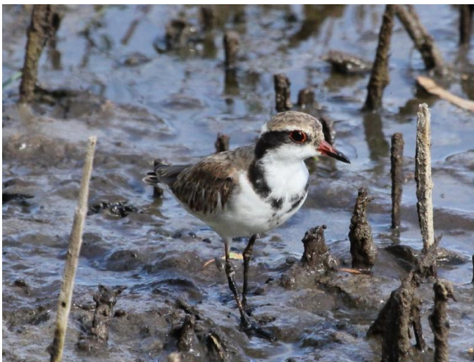
Black-fronted Dotterel - a regular visitor

The Red-kneed Dotterel nests in small hollows built in wet ground often near vegetation and eats aquatic insects, larvae and seeds. Neither has been confirmed nesting at Lake Claremont but perhaps will in the future with more protection and less disturbance as the wetland buffer is established.